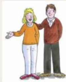
Mum and Dad